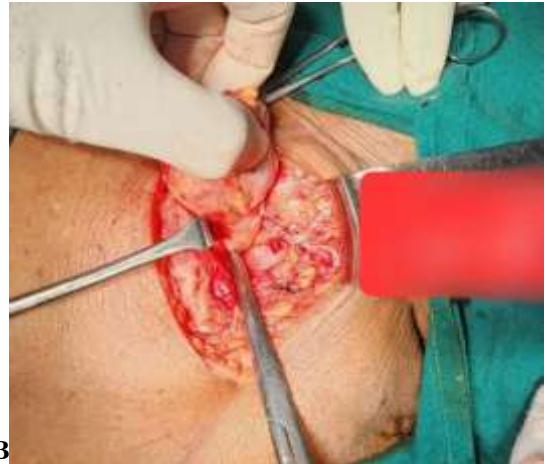
Figure 3: Intraoperative findings. A:Prolene mesh fixation over femoral canal B: Femoral hernia sac with neck seen at femoral canal